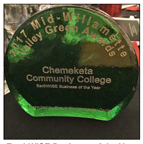
EarthWISE Business of the Year: Chemeketa Community College