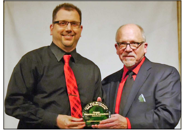
Business Recycler of the Year: Oregon Department of Corrections