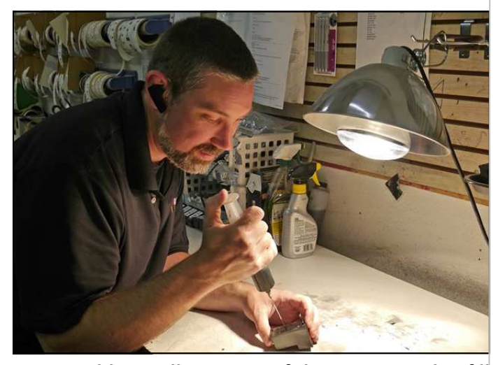
Sustainable Small Business of the Year: Rapid Refill