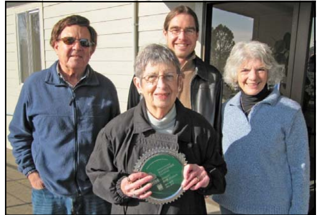
Temple Beth Sholom