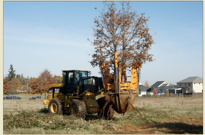
Native oak salvage operation

Finding adequate native plant material in the 1970's for the Woodscape developments wasn't easy, so John established a native plant nursery, Mahonia Vineyards and Nursery that specializes in native trees and shrubs. The nursery is widely known for its Oregon Oak rescue program that salvages native trees from sites that are about to be cleared, such as development sites and road widening projects.