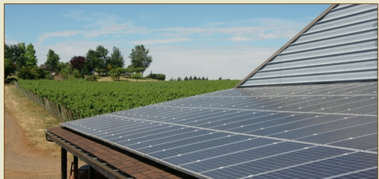
Solar panels at Mahonia Vineyard