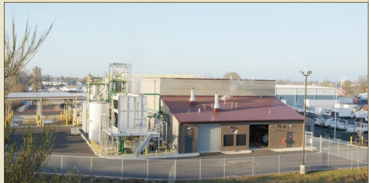
Sequential Pacific Biodiesel plant on Turner Road in SE Salem