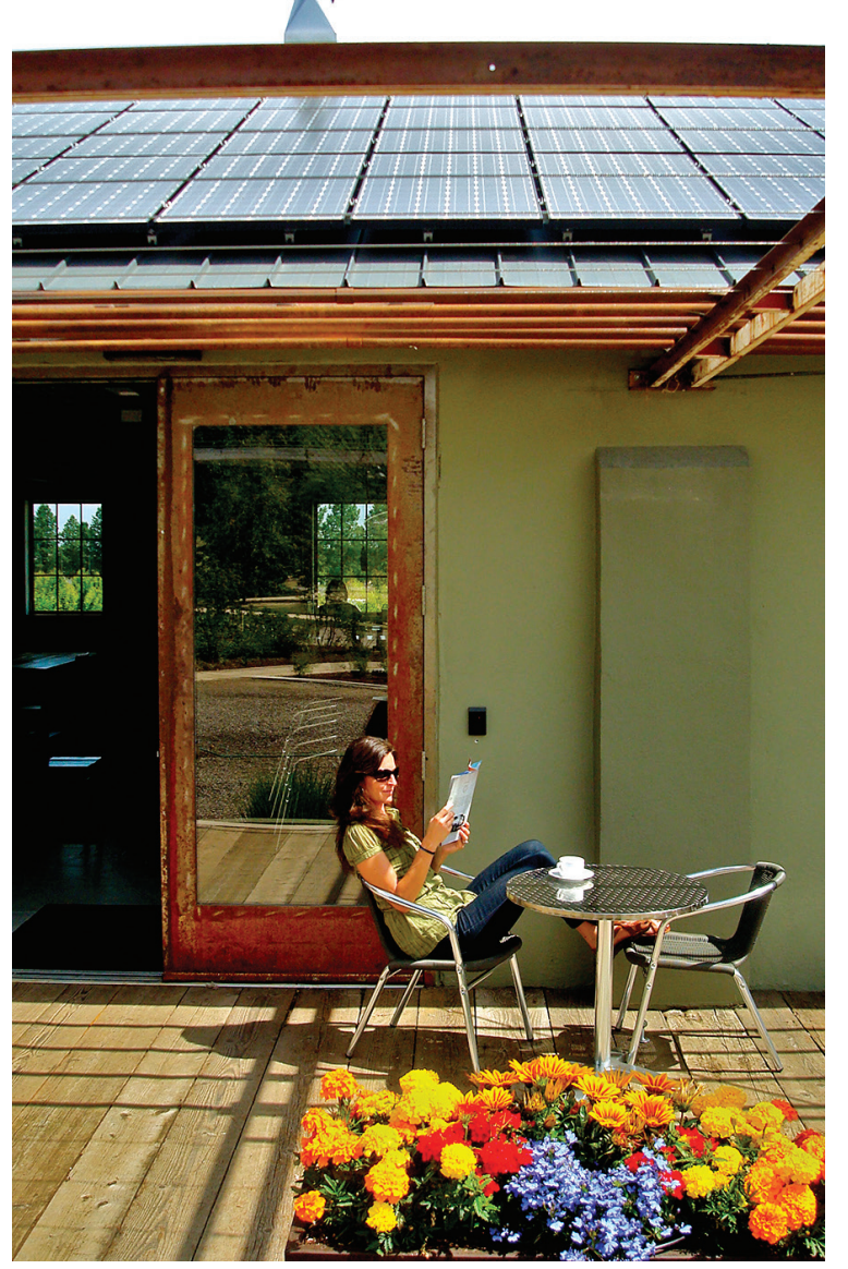
Pringle Creek Community's "Painter's Hall"

Meeting attendees not only see a green building when they are in Painter's Hall, but they are exposed to green practices. Paint-