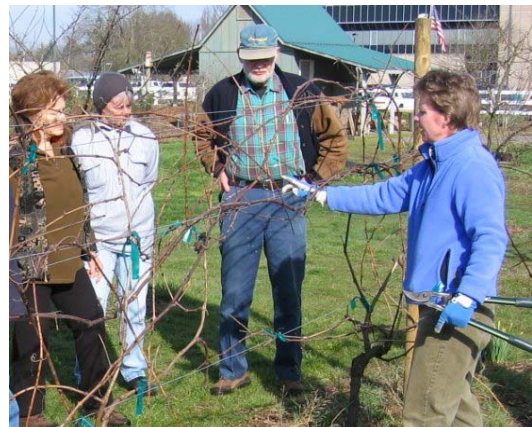
A volunteer demonstrates pruning techniques.

Acts of violence are strictly prohibited and will not be tolerated. No one shall engage in any act of workplace violence against any person during the course and scope of their work for Marion County.