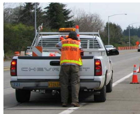
A volunteer loading safety cones after a weed pull event.

During your on-site orientation, your supervisor will discuss all applicable safety and health rules with you. You should know the emergency procedures and evacuation routes for your work site. If you are unclear about any safety policies or procedures, ask your supervisor or volunteer services coordinator.