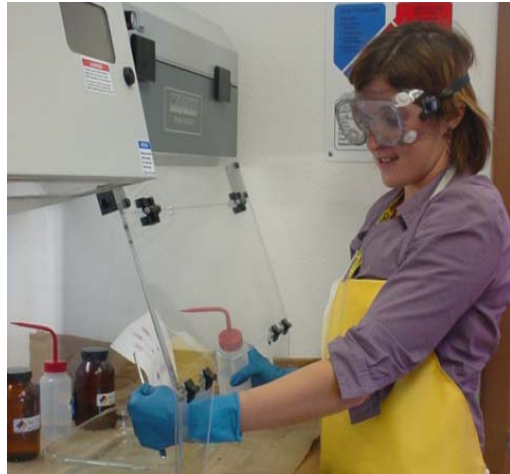
A volunteer processing fingerprints at the Forensic Lab.