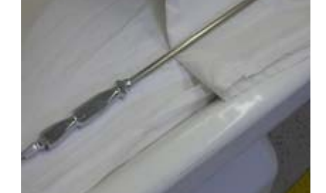
Figure 12 Figure 13

Next the embalmer uses a trocar (Figure 13) to remove body fluids from the gastrointestinal tract and lungs, then uses the same instrument to pump in cavity fluid. After completing cosmetic work as required the body is ready for a viewing.