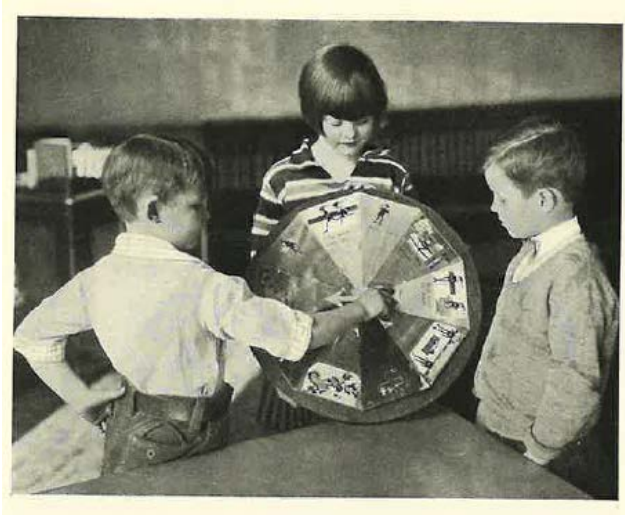
Health Habit Game played by first graders in 1930.