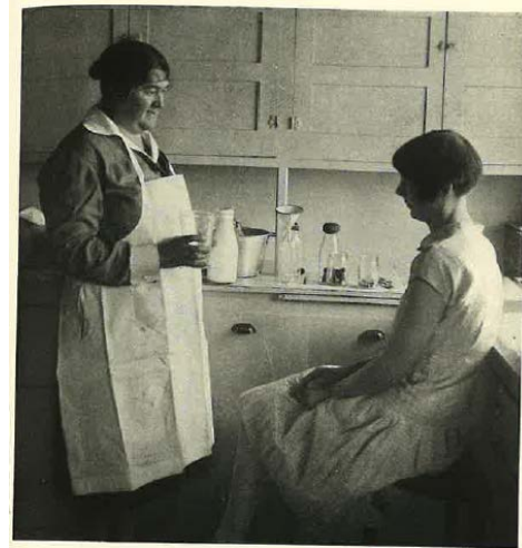
A Public Health Nurse provides education on using formula. (Children of the Covered Wagon, 1930)