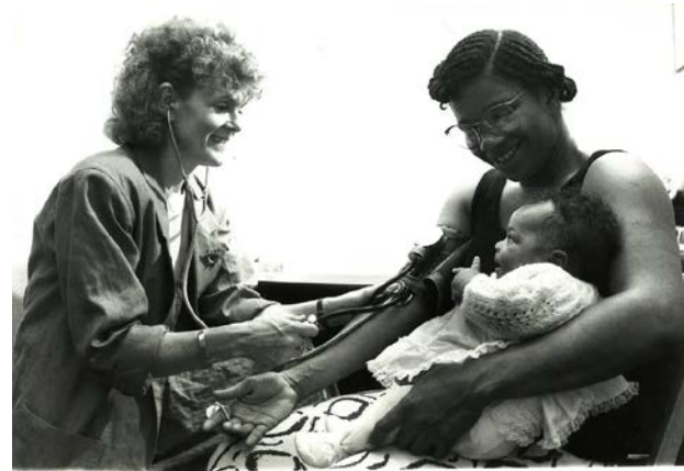
A Public Health Nurse takes a mother's blood pressure. (Undated)