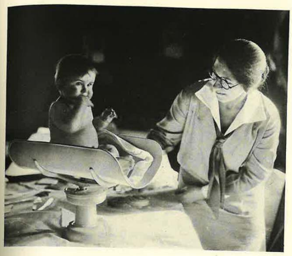
A Public Health Nurse weighs an infant during an assessment. (Children of the Covered Wagon, 1930)