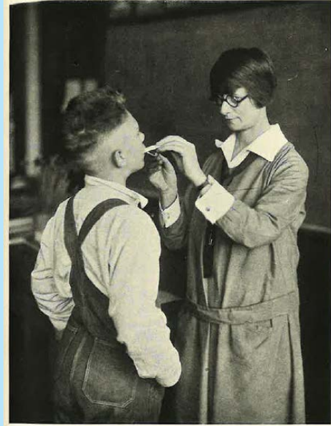
A Public Health Nurse tests for diphtheria. (1930)