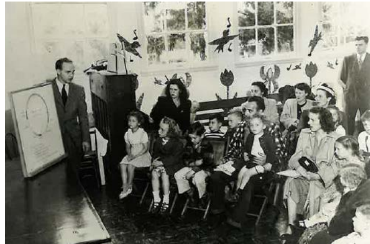
Marion County's only Health Educator speaking to a class in 1948.

The Public Health Division has Health Educators across the following programs: