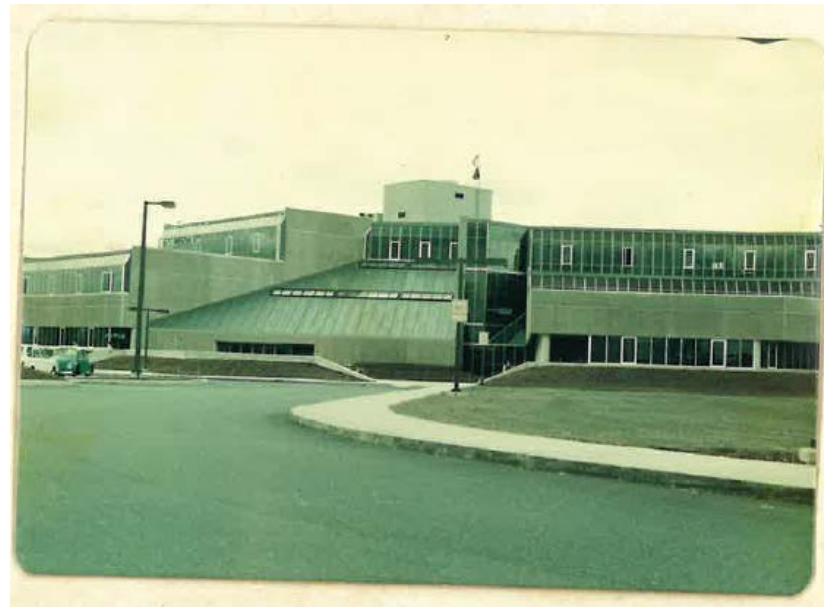
3180 Center Street building in 1975