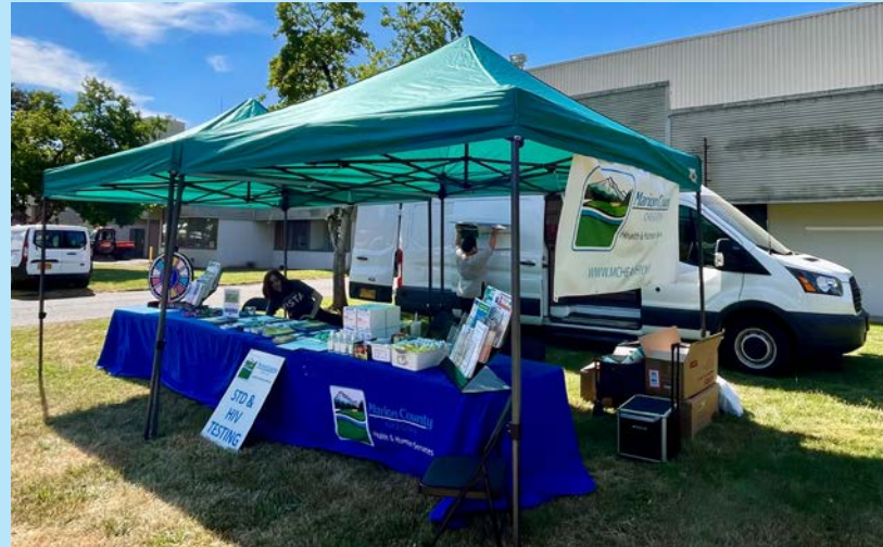
Our HIV/Early Intervention Services and Outreach team provides mobile testing for HIV and syphilis

The Communicable Disease program and the Public Health Clinic safeguard against the spread of disease in the community and provide testing and immunizations.