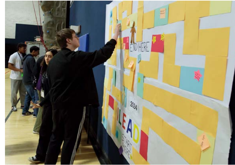
Marion County students participating in ILEAD, a youth leadership summit. (2024)