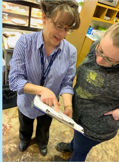
Environmental Health Specialists conduct inspections (Photo from 2023)