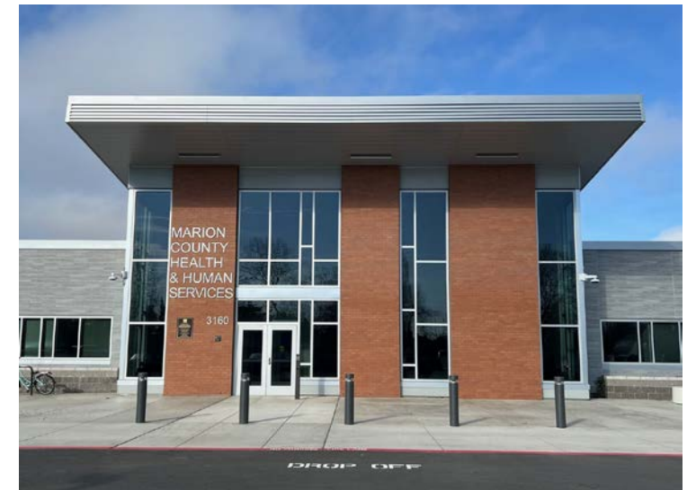
Marion County Public Health is currently based out of 3160 Center Street