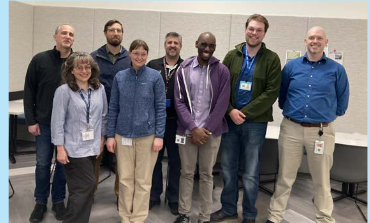
The Environmental Health team (2024)

The Environmental Health Program enforces health and safety regulations and keeps our drinking water safe.