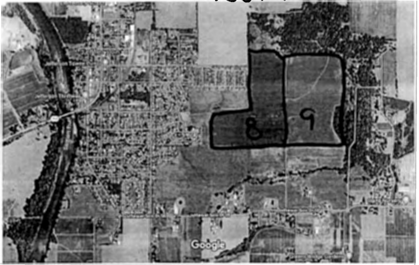
Imagery ©2018 DigitalGlobe, State of Oregon, Map data ©2018 Google 1000 ft