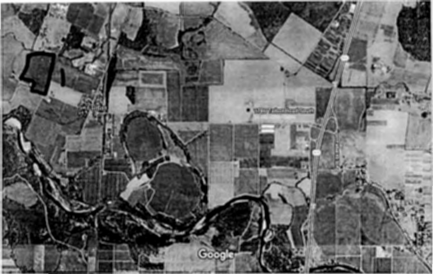
2000 ft