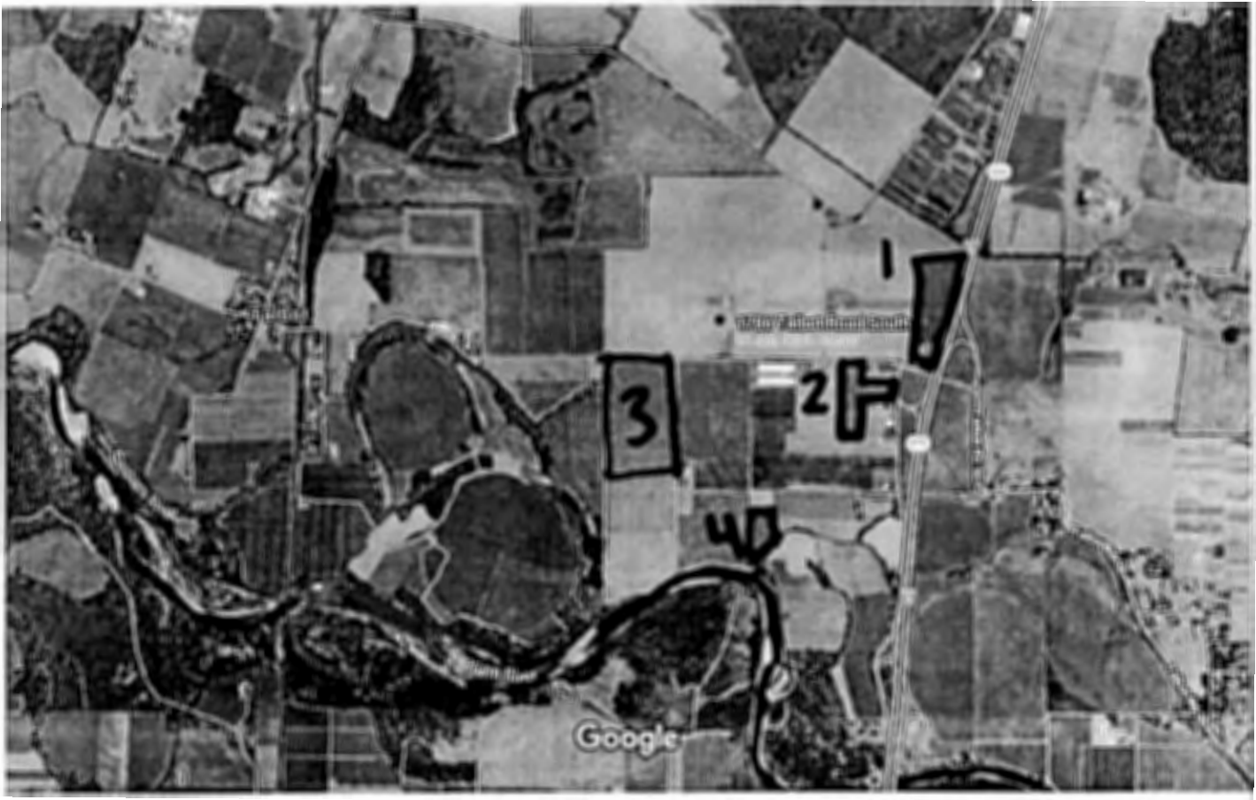
2000 ft

Map Reference # 1 Mint # 2 Bentgrass # 3 Bentgrass # 4 Bentgrass