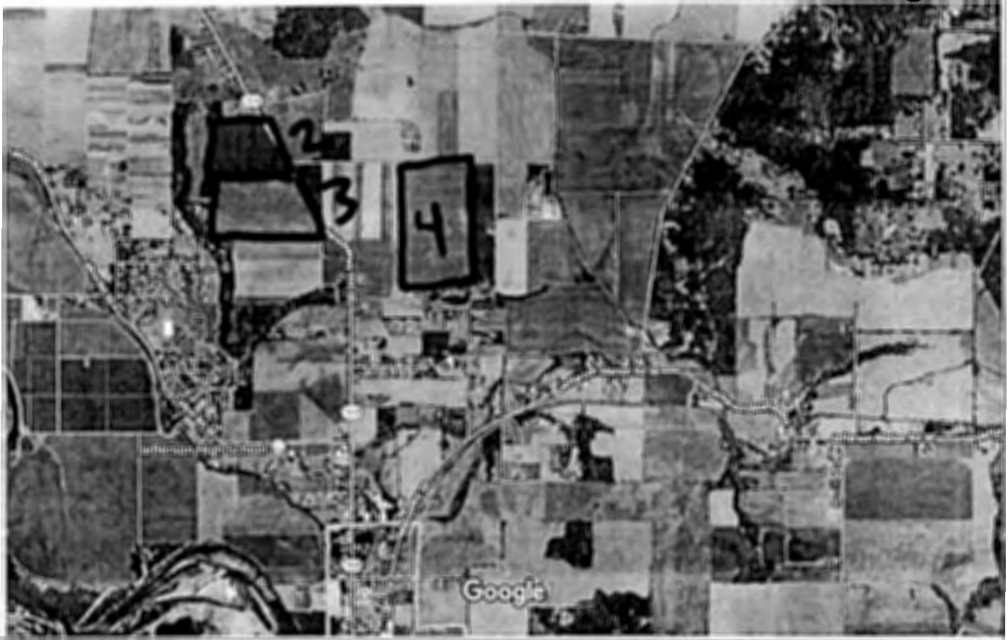
2000 ft

Map Reference #2 Mint #3 Clover #4 Bentgrass