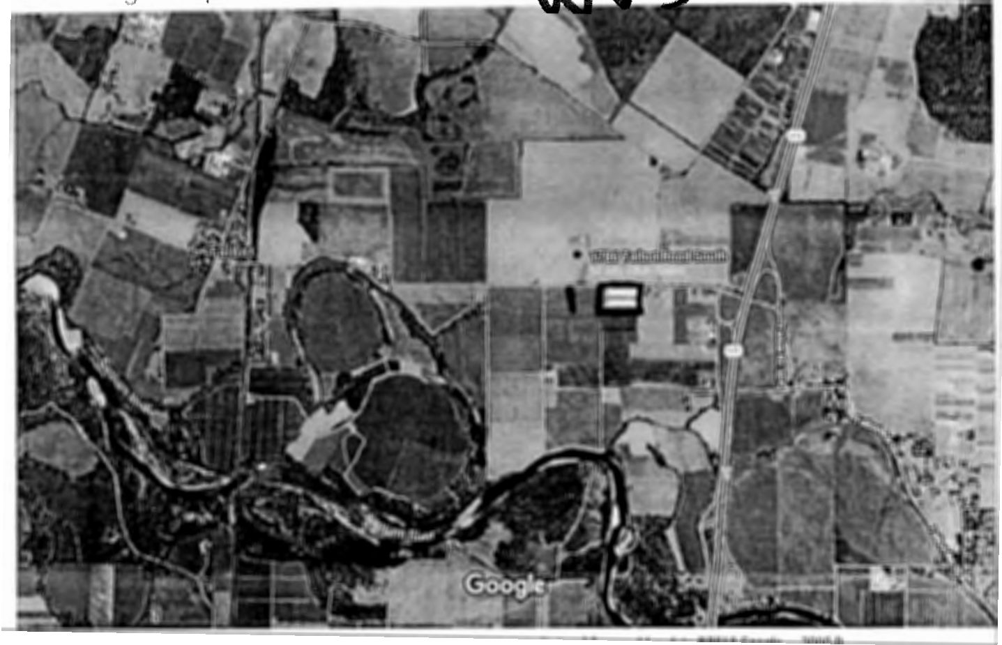
Imagery ©2018 DigitalGlobe, Landsat / Copernicus, State of Oregon, Map data ©2018 Google