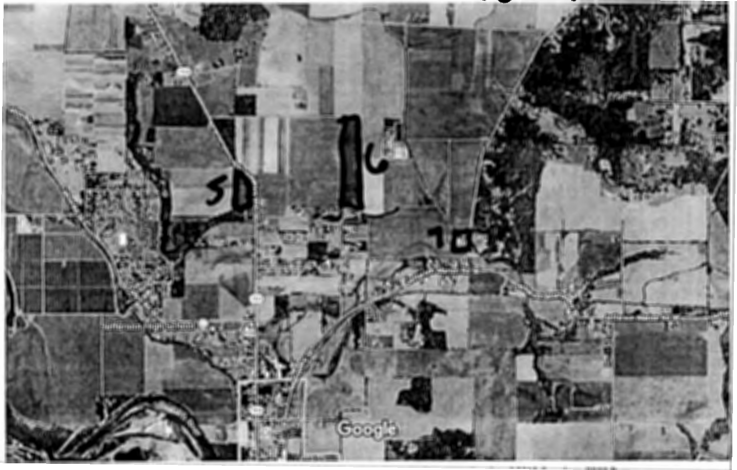
2000 ft

Map Reference #5 Clover #6 Mint #7 Distillery