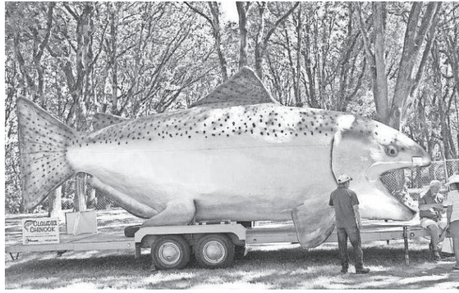
Salem Environmental Education offered children and their parents tours of the iconic chinook salmon at the 2017 Salem Art Fair.