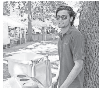
Garten Services assisted with organizing the first ever food waste recovery.

ment with the compost and recycling bins located next to every trash can with signs labeling each can for its appropriate contents.