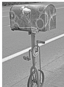
South Salem Cycleworks promoted biking in many creative ways — such as this custom mailbox.