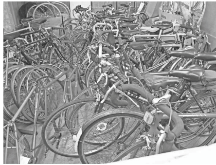
Scores of bikes are still part of the Cycleworks inventory and will be available online.