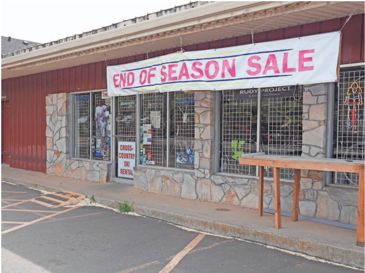
No longer lined with scores of bikes waiting for a new rider, South Salem Cycleworks closed its doors May 31.