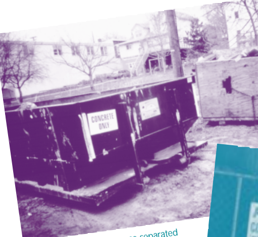
Labeled containers for source-separated C&D materials.

site? A Very important. Materials intended for salvage or reuse can be damaged or destroyed if not properly stored. Even a small amount of other materials in a bin of recyclables can make the entire bin unacceptable for recycling.