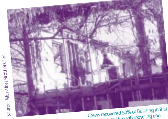
Crews recovered 50% of Building #20 a Stowe Village through recycling and salvaging materials for reuse.

authority to require a deconstruction training program as part of development proposals. The project general contractor, Manafort Brothers, Inc. worked with the HHA, Self-Reliance Inc., and the Laborers' International Union to recruit and train nine public housing residents in deconstruction techniques. The general contractor entered into partnership with the HHA and the nine resident workers to form the Hartford Community Deconstruction Service Company.