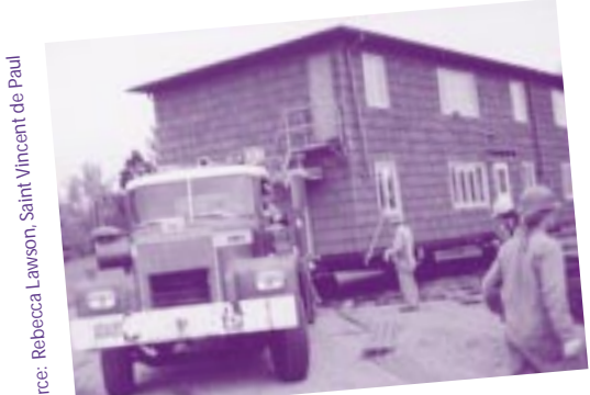
Contractor moving one of the buildings for the Bagley Downs apartment complex

• Allot enough time for project completion.