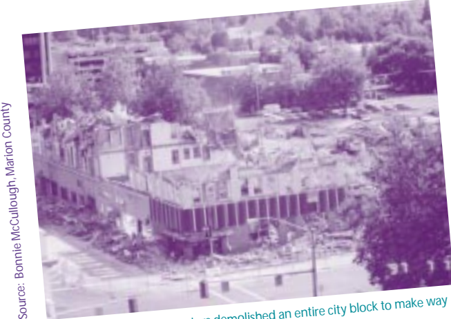
Contractors demolished an entire city block to make way for Salem's new Courthouse Square.

Include reuse, recycling, and waste prevention strategies early in the process.