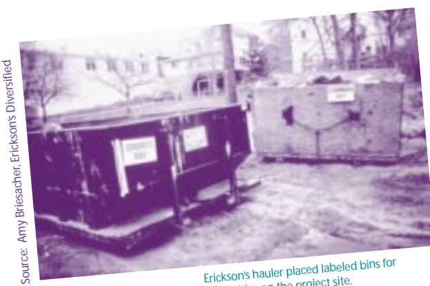
recyclables on the project site

Communicate the goal and report project progress, success, and failures to