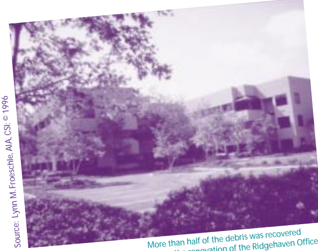
during the renovation of the Ridgehaven Office Building

Include environmental procedures in the project specifications that address construction materials reuse and recycling.