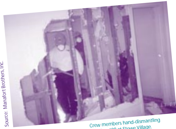
Building #28 at Stowe Village.

Use the Laborers' International Union to train workers in materials recovery methods