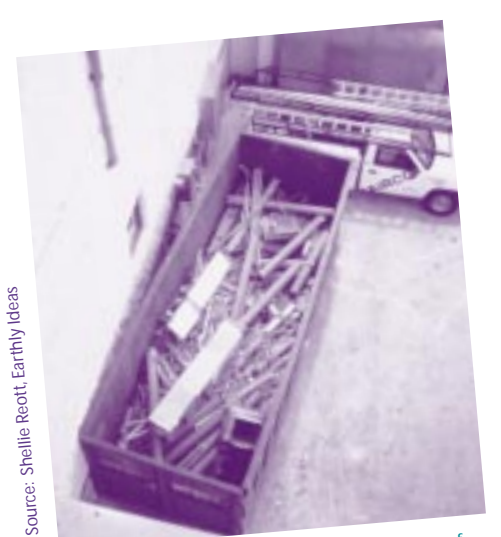
Contractors sorted over 6 tons of metal into roll-offs for recycling.

If space is limited, use a separate storage facility for reusable items to avoid unnecessary moving of materials.