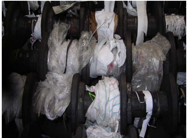
Plastic bags tangled in machinery at a mixed recycling sorting facility. Sorting lines have to be shut down as often as once an hour to remove plastic bags and other contaminants.

~Sophie Tomczyk, Environmental Services Intern