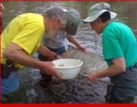
Master Naturalist Survey p. 3

MARION COUNTY PUBLIC WORKS - ENVIRONMENTAL SERVICES