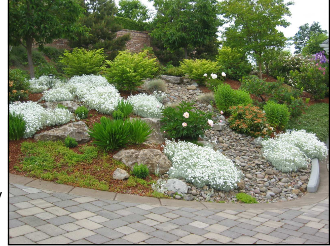
Dry creeks can help capture runoff while providing a striking landscape feature.

The three EarthWISE-certified landscaping companies in Marion County will tell you. In order to get that weed-free perfect, polished look, you have to spend a lot of another kind of green—money—on fertilizers, pesticides, water and even new sod every few years. So not only is it bad for the environment, it is bad for your budget.