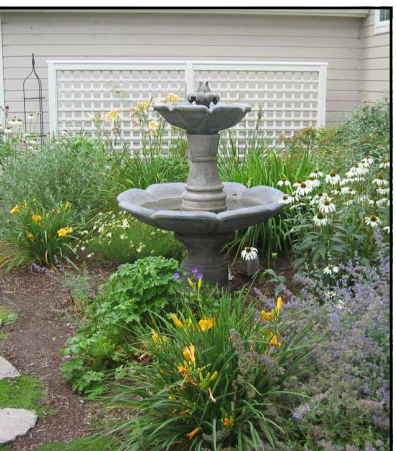
Porous surfaces allow better water infusion and hardy perennials with low water needs add lots of color.

Angels are the three landscape companies in Marion County to earn EarthWISE certification. For landscapers, EarthWISE certification shows clients that these companies not only run their business in an environmentally friendly way, but they also take an eco-approach to their clients' landscape projects.