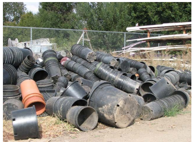
Broken and worn nursery pots are given to plastics recycler Agri-Plas

In addition to making some of its own mulch, DeSantis employees tried their hand at brewing their own compost tea three years ago. Compost tea is an inoculant that introduces beneficial bacteria, fungi, protozoa and nematodes to the soil. DeSantis employees mix a 200-gallon batch about once a month for use on clients' properties. Switching to their homemade brew has saved the company 50 percent of the cost of the tea.