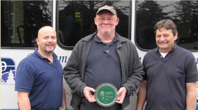
Willamette Lutheran Retirement Community