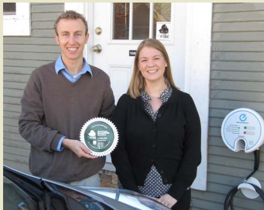
Complex Two Computers