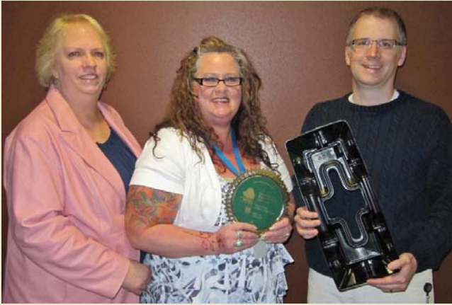
City of Salem—Information Technology