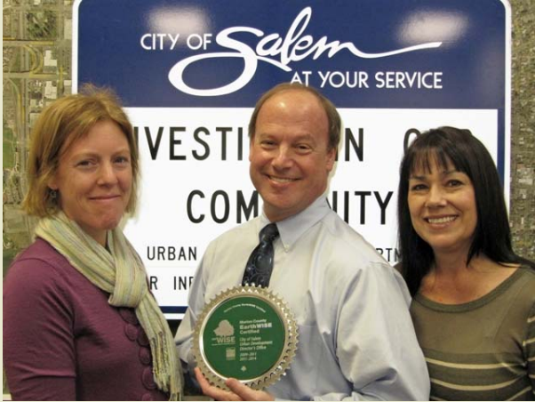
City of Salem—Urban Development Director's Office