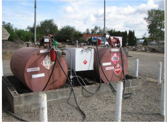
DeSantis Landscapes uses bulk fuel for its landscaping equipment

Landscaping equipment that used inefficient two-stroke engines has been replaced with four-stroke alternatives. The result: a quieter and more efficient machine. The older-model leaf blowers, for example, ranged from 80 to 90 decibels. The new ones are quieter – at 60-70 decibels. And the newer ones reduce emissions by as much as 80 percent. The more efficient machines cost no more than the two-stroke ones, but DeSantis also switched to buying fuel for this equipment in bulk, which saves the company 50 percent in fuel costs.