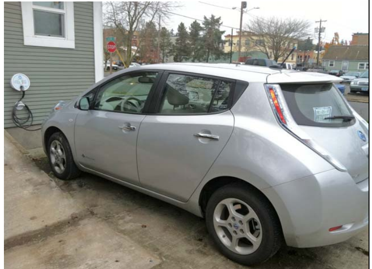
Sparky’s home, at the corner of Oak and Second Streets in Silverton, is the site of the 2011 Leaf’s recharging station.

Staff at Compex Two are open to questions from the curious—just give them a call at 503-873-0188.