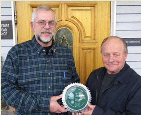
AJ's Auto Repair