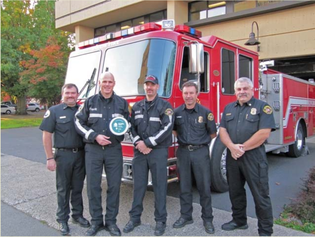
Salem Fire Department