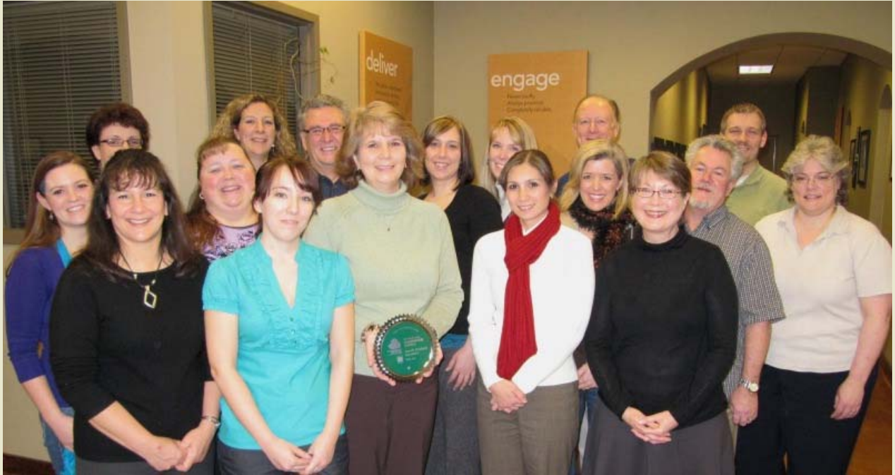
Cascade Employers Association