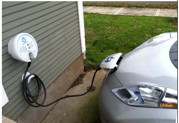
Electric cars vary on their recharging times—from a “quick charge” 30 minutes to a “home plug” 20 hours—depending on the station type. Sparky can go from empty to full in about six hours with this model.

Compex Two Computers was an early adopter of the EarthWISE program (certified in 2007) and has taken a variety of steps to promote a sustainable work environment. These include: