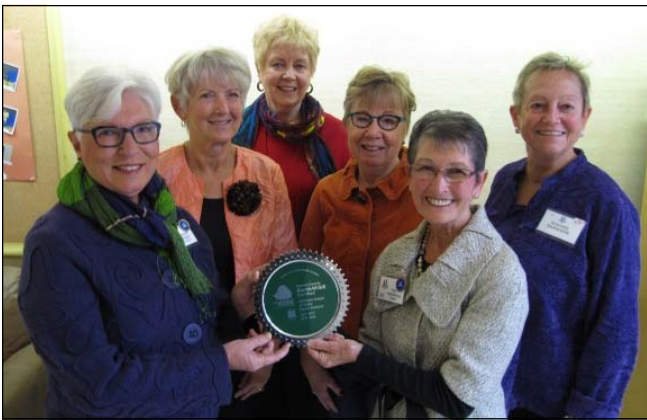
Assistance League - Encore Furniture