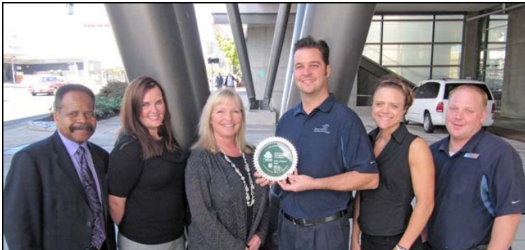
Salem Convention Center