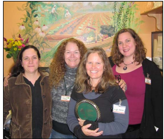
LifeSource Natural Foods