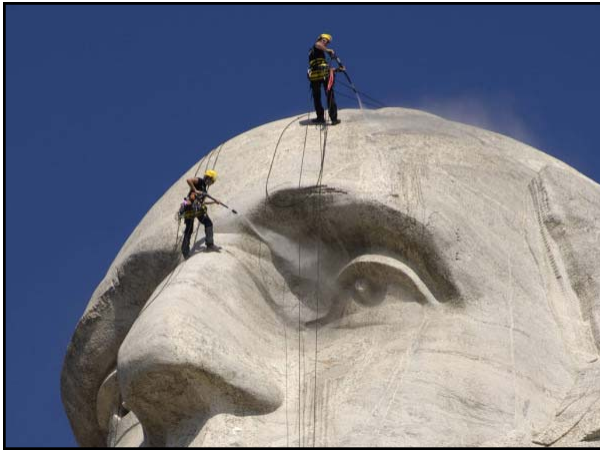
George Washington got his first "facial" in 2005.

Green cleaning can be defined as "effective cleaning that protects health without harming the environment."