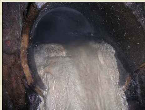
An example of a cascading fatberg.