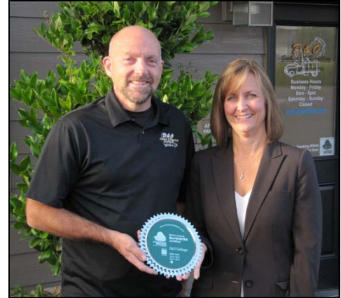
D & O Garbage