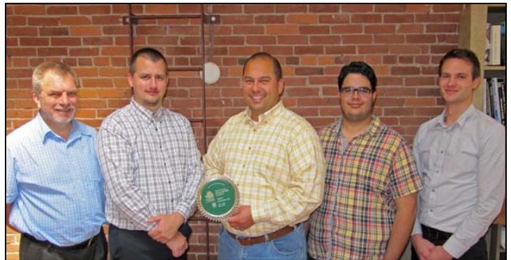
Studio 3 Architecture, Inc.