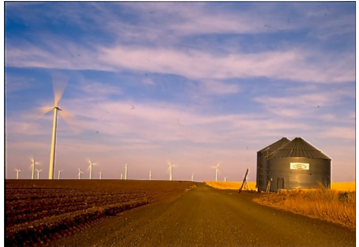
Klondike wind turbines can generate 400 megawatts of electricity