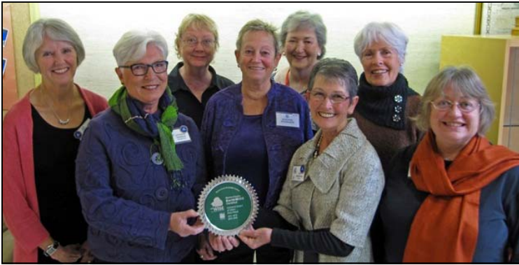
Assistance League - Daue House