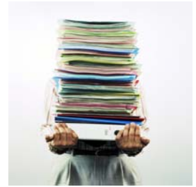
The average office worker uses 10,000 sheets of paper a year

When it comes time to replace your current printer or copy machine, make sure to choose a machine that has duplex capabilities and that is Energy Star certified.