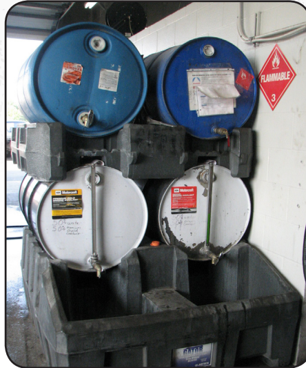
Hillyer's purchases coolants, degreasers and cleaners in 55-gallon drums instead of one-gallon or 16-ounce containers. A specially designed container catches any leaks.

A 55-gallon drum in a central area of the shop holds used aerosol containers – the cleaners and agents