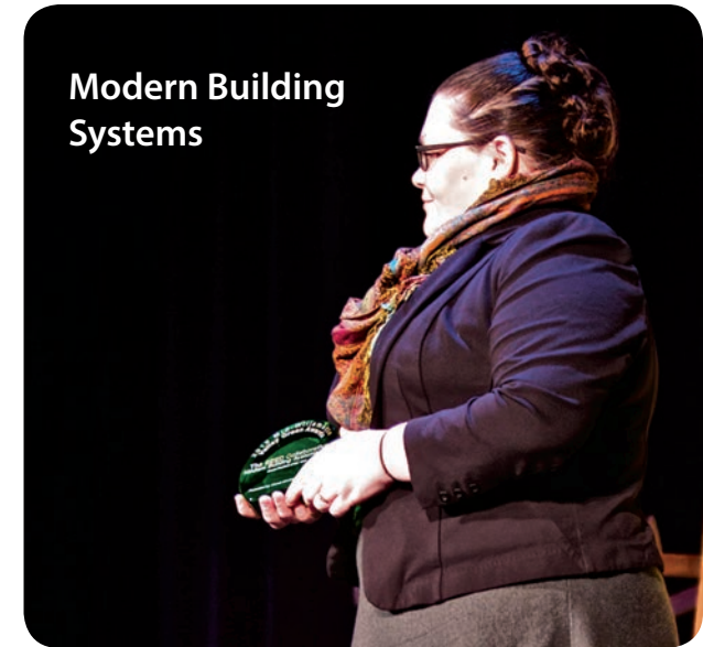
Modern Building Systems