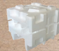
Styrofoam Block (clean, dry & snaps when bent)