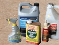
Chemicals, Solvents, Fuels