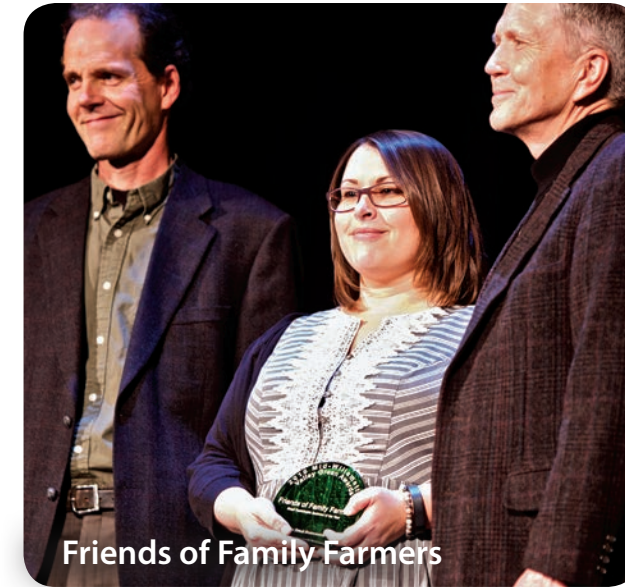
Friends of Family Farmers