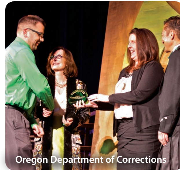
Oregon Department of Corrections