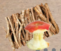
Yard Debris/Fruit & Vegetable Scraps

Do you live in Aumsville, Gervais, Scotts Mills, Sublimity, Saint Paul, Donald, or Brooks?