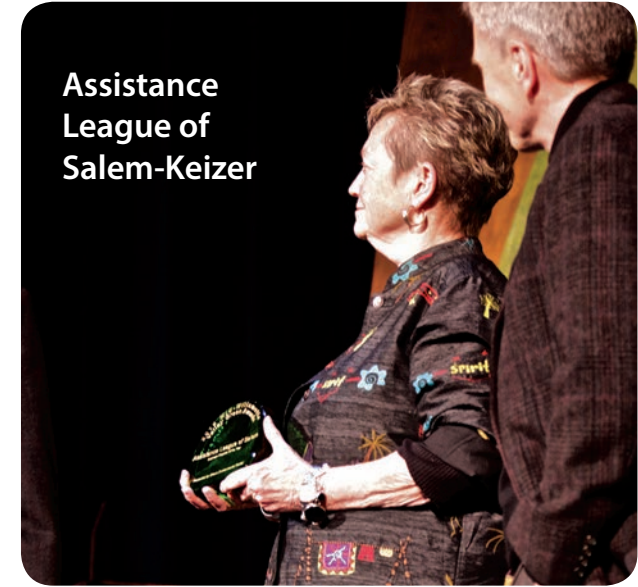
Assistance League of Salem-Keizer