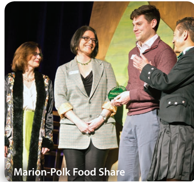
Marion-Polk Food Share