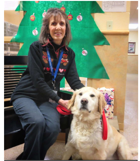
Volunteers at the Dog Shelter

Volunteer mentors are an invaluable asset to the youth in this program. One such example is a volunteer mentor who has worked with a youth for several years. The youth and mentor do a variety of fun activities together such as hiking, fishing, and volunteering. The youth enjoys volunteering at the Willamette Humane Society where the duo serves as Kennel Buddies. As Kennel Buddies, they walk and play with dogs and take care of them. This is a great opportunity to allow the youth to give back to the community, as well as gain new skills. The mentors worth cannot be calculated by the many hours put in this year, but by the amazing difference he has made in this youth's life.