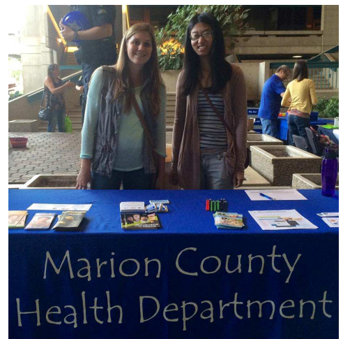
Public Health Interns provide resource materials at a community fair.

The LADPC has been a strong advocate for alcohol and drug treatment services in Marion County. LADPC has played an integral role in identifying treatment and prevention needs of the