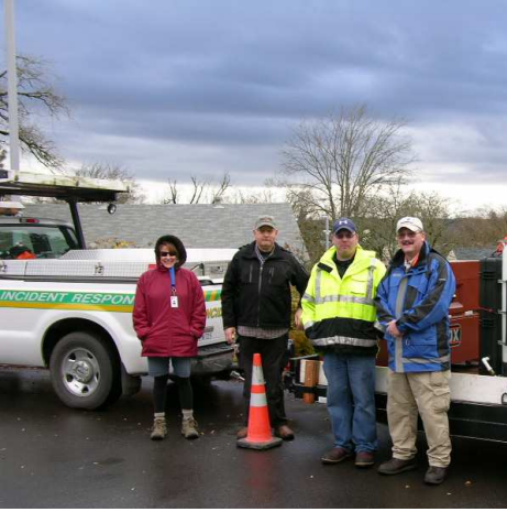
Emergency Management Volunteers in action

Volunteers make a one year commitment and interns a 6 month, 20 hours a week commitment. With the help of these volunteers, the District Attorney's Office served approximately 2,600 victims and provided in excess of 10,000 services to these victims. This includes crisis intervention, case information and referral for resources, referral for emergency financial assistance, assistance filling out temporary restraining order forms, accompaniment to court, restitution information, and Spanish speaking court advocacy. Volunteers are integral to the work of the Victim Assistance Division.