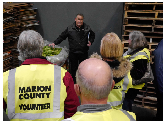
Master Recyclers at a local grocery distribution center

The combined after-school programs, including Early College High School and Straub Summer Camp day programs in the field, engaged students in education and service learning.