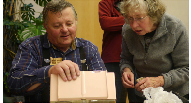
A Master Recycler volunteer fixes small electronics at the Repair and Share

This Board consists of five volunteers from the local agriculture community. They meet annually with representatives of the Assessor's Office (generally in March) to review the income and expense factors the Assessor uses to value farm-use land. Volunteers give expert advice on current farming practices, land use laws, and equipment for appraisal purposes. This benefits our appraisal staff in determining values for taxation purposes, and also to help us determine if farm/rural properties may qualify for special assessment (reduction in taxes).