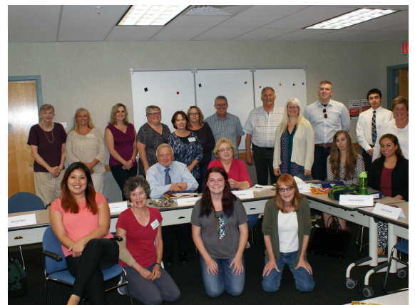
Victim Assistance Advocate Basic Training

Our volunteer intern helped in so many ways by completing the time consuming tasks required to prepare major cases for trial. This allowed the investigators to focus on other specific tasks for the cases.