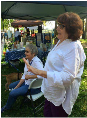
Dog Shelter Volunteers at the local Saturday Market

Mission: To promote safe and thriving communities for people to live, learn, work and play. Thriving communities are important for social and economic health and are a priority for the county.