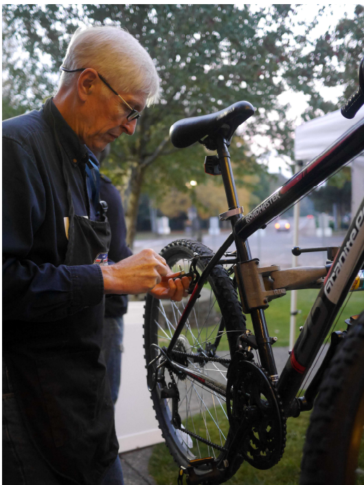
A volunteer fixes a bike at the Repair Fair & Share