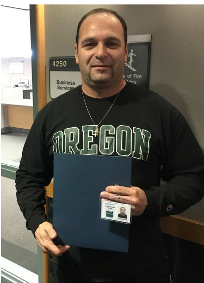
A new volunteer finishes up orientation.

The Compensation Study Committee was created to establish a sound classification and compensation system that is fair, flexible, and competitive. This committee has a total of 13 members, 2 of which are volunteers who have compensation related experience.