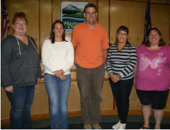
Members of the 2015 Marion County Fair Board.

the community, aligns systems, plus develops and secures new resources.